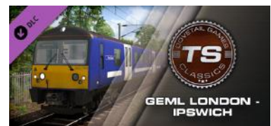
DTG GEML London - Ipswich