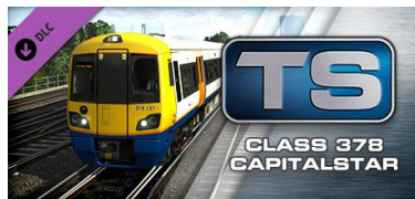
DTG Class 378 Capitalstar