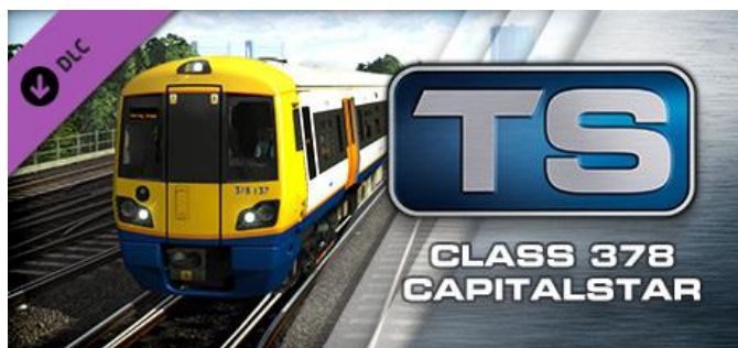
DTG Class 378 Capitalstar

For this soundpack to work you will require the base game Train Simulator 2019 and the following DLC