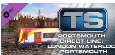
DTG Portsmouth Direct Line