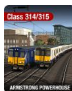
AP Class 314/315 EMU Pack