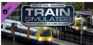
DTG North London & Goblin Lines

To be able to drive this scenario, you will need the following DLC: