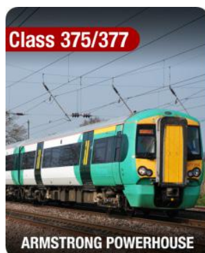
Armstrong Powerhouse Class 375/377 Soundpack